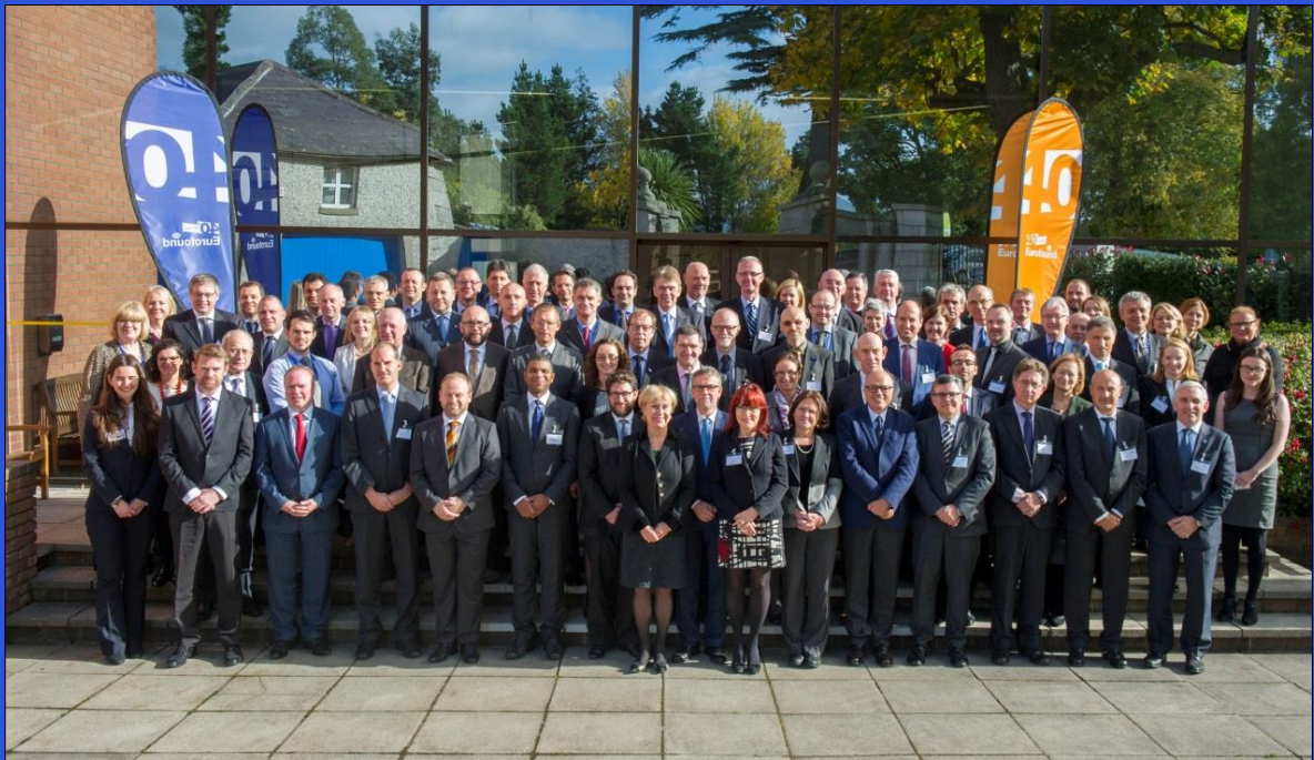
Heads of Agencies, Dublin, 22-23 October 2015